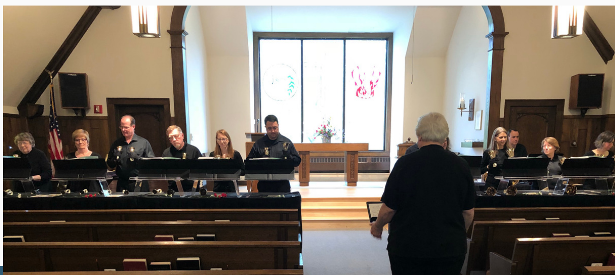
Handbell Choir in action - May 2018